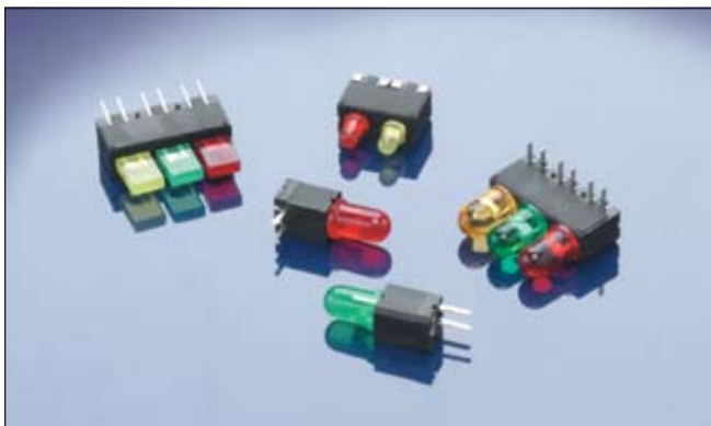
U.S. & Foreign Patents Issued and Pending